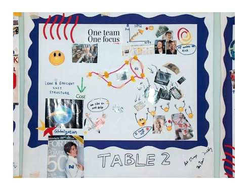
How AI summits changed Hewlett Packard, page 46

The AI Summit invites organizations to transcend the quest to manage people, and instead focus upon the macromanagement of meaning.